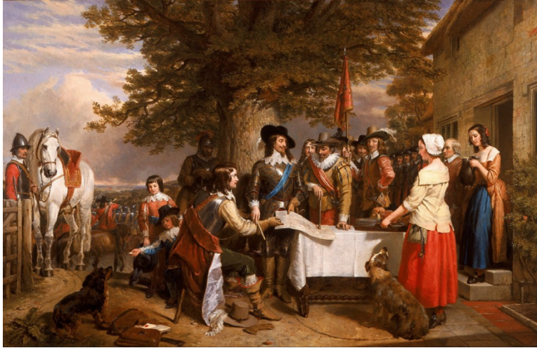
King Charles I, pictured with the blue sash of the Order of the Garter, listens to his commanders detail the strategy for what would be the first pitched battle of the First English Civil War. As all previous constitutional compromises between King Charles and Parliament had broken down, both sides raised large armies in the hopes of forcing the other side to concede their position. The Battle of Edgehill ended with no clear winner, leading to a prolonged war of over four years and an even longer series of wars (known generally as the English Civil War) that eventually established the Commonwealth of England in 1649. Charles Landseer, The Eve of the Battle of Edge Hill, 1642, 1845.

In 1642, no permanent English North American colony was more than thirty-five years old. The Crown and various proprietors controlled most of the colonies, but settlers from Barbados to Maine enjoyed a great deal of independence. This was especially true in Massachusetts Bay, where Puritan settlers governed themselves according to the colony's 1629 charter. Trade in tobacco and naval stores tied the colonies to England economically, as did religion and political culture, but in general the English government left the colonies to their own devices. The English Revolution of the 1640s forced settlers in America to reconsider their place within the empire. Older colonies like Virginia and proprietary colonies like Maryland sympathized with the Crown. Newer colonies like Massachusetts Bay, populated by religious dissenters taking part in the Great Migration of the 1630s, tended to favor Parliament. Yet during the war the colonies