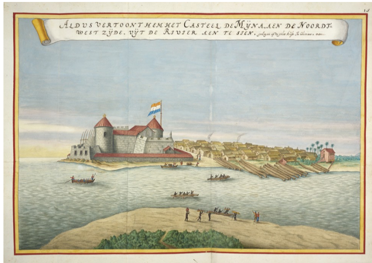
The first trading post built on the Gulf of Guinea and the oldest European building southern of the Sahara, Elmina Castle was established as a trade settlement by the Portuguese in the fifteenth century. The fort became one of the largest and most important markets for African slaves along the Atlantic slave trade. "View of the castle of Elmina on the north-west side, seen from the river. Located on the gold coast in Guinea," in Atlas Blaeu van der Hem, c. 1665–1668.

Ideas about the rule of the household were informed by legal and customary understandings of marriage and the home in England. A man was expected to hold “paternal dominion” over his household, which included his wife, children, servants, and slaves. By contrast, slaves were not legally masters of households and were therefore subject to the authority of the white “master,” usually a slave owner. Slave marriages were not recognized in colonial law. Some enslaved men and women married “abroad”; that is, they married individuals who were not owned by the same slaveholder and did not live on the same plantation. These husbands and wives had to travel miles at a time, typically only once a week on Sundays, to visit their spouses. Legal or religious authority did not protect these marriages, and slaveholders could refuse to let their slaves visit a spouse, or