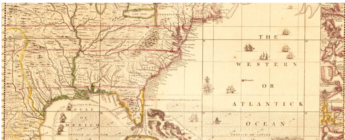
Henry Popple, A map of the British Empire in America with the French and Spanish settlements adjacent thereto , 1733. Library of Congress.

To attract colonists, the Lords Proprietor offered alluring incentives: religious tolerance, political representation by assembly, exemption from fees, and large land grants. These incentives worked, and Carolina grew quickly, attracting not only middling farmers and artisans but also wealthy planters. Colonists who could pay their own way to Carolina were granted 150 acres per family member. The Lords Proprietor allowed for slaves to be counted as members of the family. This encouraged the creation of large rice and indigo plantations (more stable commodities than deerskins and Indian slaves) along the coast of Carolina. Because of the size of Carolina, the authority of the Lords Proprietor was especially weak in the northern reaches on Albemarle Sound. This region had been settled by Virginians in the 1650s and was increasingly resistant to Carolina authority. As a result, the Lords Proprietor founded the separate province of North Carolina in 1691. 19