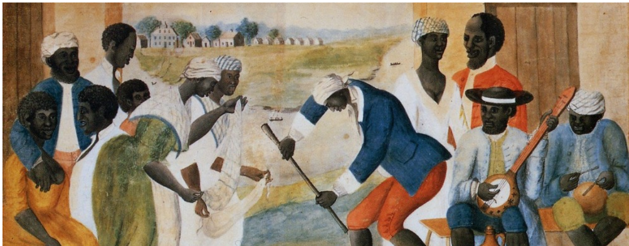
Unidentified artist, The Old Plantation , c. 1790–1800, Abby Aldrich Rockefeller Folk Art Museum. Wikimedia.