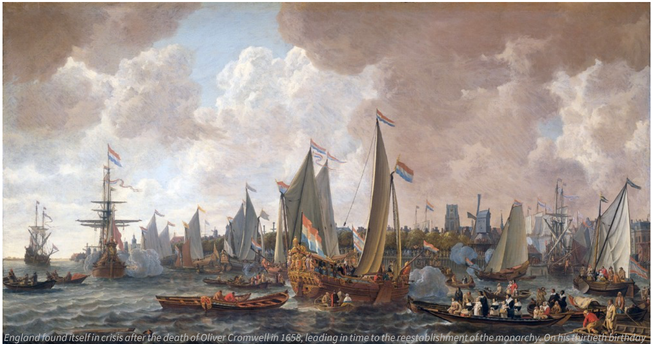
England found itself in crisis after the death of Oliver Cromwell in 1658, leading in time to the reestablishment of the monarchy. On his thirtieth birthday (May 29, 1660), Charles II sailed from the Netherlands to his restoration after nine years in exile. He was received in London to great acclaim, as depicted in this contemporary painting. Lieve Verschuler, The Arrival of King Charles II of England in Rotterdam, 24 May 1660, c. 1660-1665.

in 1688. In that year a group of bishops and Parliamentarians offered the English throne to the Dutch Prince William of Holland and his English bride, Mary, the Protestant daughter of James II. This relatively peaceful coup was called the Glorious Revolution .