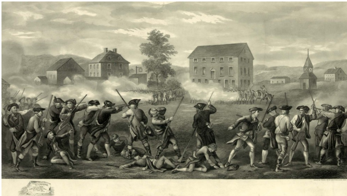
“The Battle of Lexington,” Published by John H. Daniels & Son, c. 1903.

The petition arrived in England on August 13, 1775, but before it was delivered, the king issued his own “Proclamation for Suppressing Rebellion and Sedition.” He believed his subjects in North America were being “misled by dangerous and ill-designing men,” who were “traitorously preparing, ordering, and levying war against us.” In an October speech to Parliament, he dismissed the colonists’ petition. The king had no doubt that the resistance was “manifestly carried on for the purpose of establishing an independent empire.” 33 By the start of 1776, talk of independence was growing while the prospect of reconciliation dimmed.