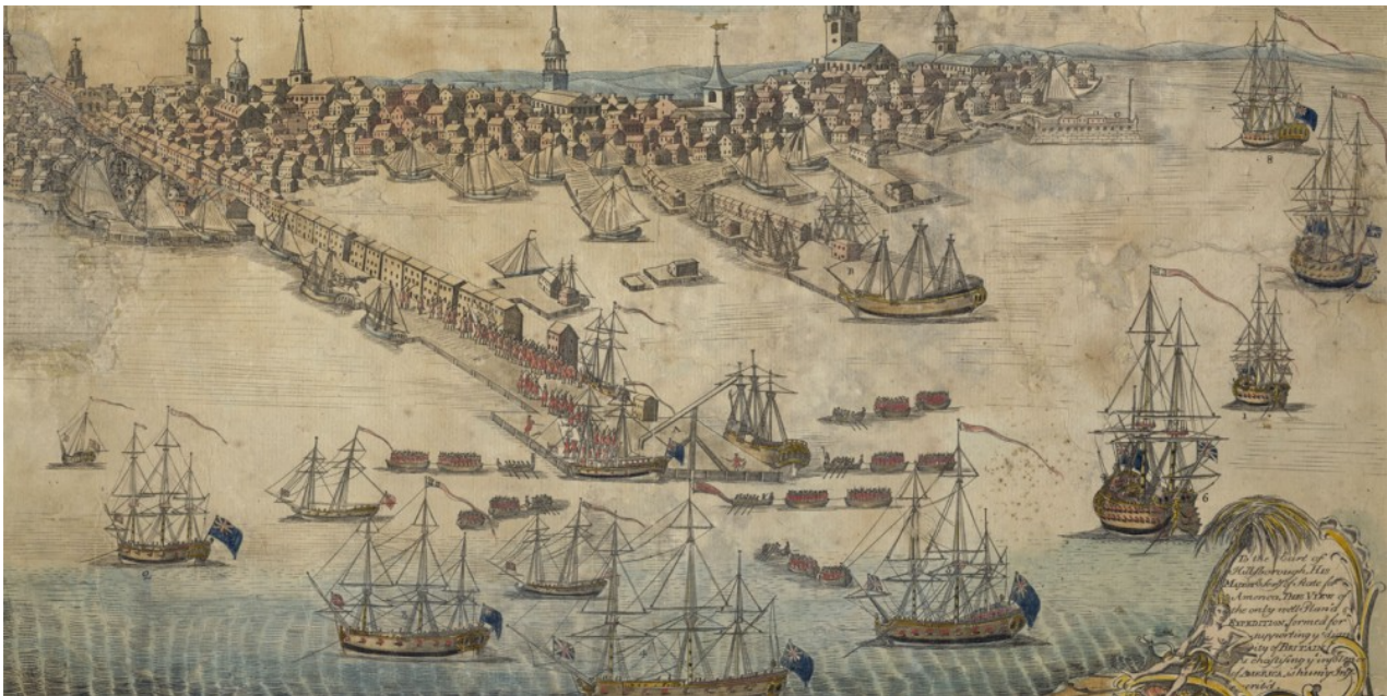
Paul Revere, Landing of the Troops, c. 1770. Courtesy American Antiquarian Society. Attribution-NonCommercial-ShareAlike 4.0 International (CC BY-NC-SA 4.0).

The Revolution built institutions and codified the language and ideas that still define Americans' image of themselves. Moreover, revolutionaries justified their new nation with radical new ideals that changed the course of history and sparked a global “age of revolution.” But the Revolution was as paradoxical as it was unpredictable. A revolution fought in the name of liberty allowed slavery to persist. Resistance to centralized authority tied disparate colonies ever closer together under new governments. The revolution created politicians eager to foster republican selflessness and protect the public good, but also encouraged individual self-interest and personal gain. The “founding fathers” did not instigate and fight a revolution to create a “democracy” in America, yet common colonists joined the fight, unleashing popular forces that shaped the Revolution itself, often in ways not welcomed by elite leaders. These popular forces continued to shape the new nation and indeed the rest of American history.