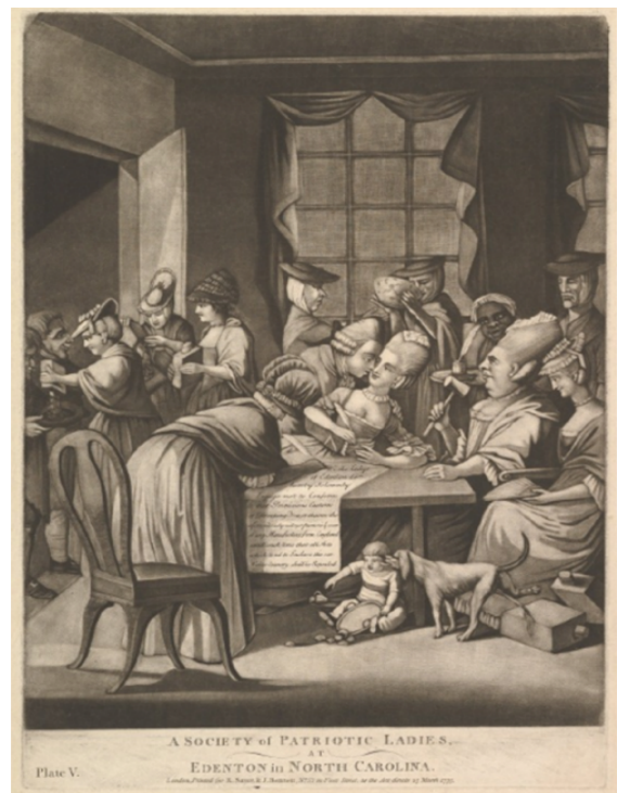
In the thirteen colonies, boycotting women were seen as patriots. In British prints such as this, they were mocked as immoral harlots sticking their noses in the business of men. Philip Dawe, “A Society of Patriotic Ladies at Edenton in North Carolina,” March 1775.

In 1783, thousands of Loyalist former slaves fled with the British army. They hoped that the British government would uphold the promise of freedom and help them establish new homes elsewhere in the Empire. The Treaty of Paris, which ended the war, demanded that British troops leave runaway slaves behind, but the British military commanders upheld earlier promises and evacuated thousands of freedmen, transporting them to Canada, the Caribbean, or Great Britain. They would eventually play a role in settling