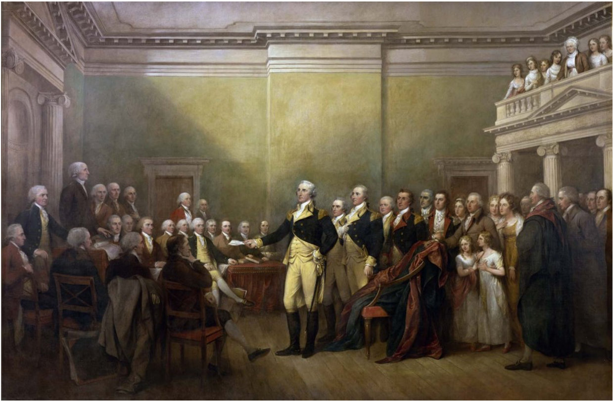
Another John Trumbull piece commissioned for the Capitol in 1817, this painting depicts what would be remembered as the moment the new United States became a republic. On December 23, 1783, George Washington, widely considered the hero of the Revolution, resigned his position as the most powerful man in the former thirteen colonies. Giving up his role as Commander-in-Chief of the Army insured that civilian rule would define the new nation, and that a republic would be established rather than a dictatorship. John Trumbull, General George Washington Resigning His Commission, c. 1817-1824.

more broadly, the Revolution ended the mercantilist economy, opening new opportunities in trade and manufacturing.