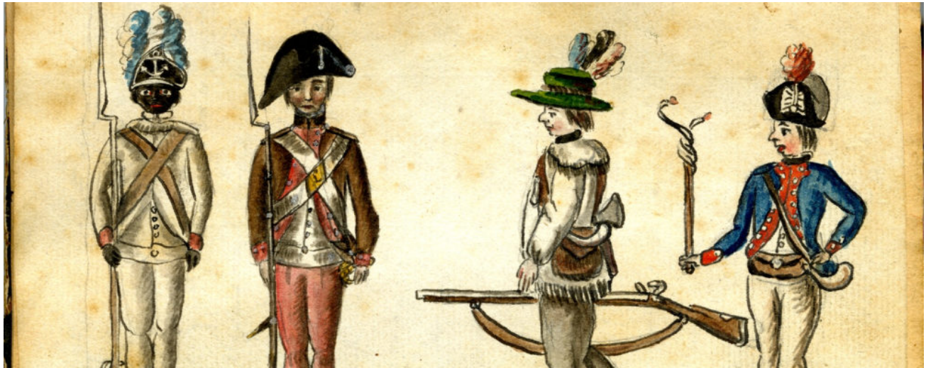
American soldiers came from a variety of backgrounds and had numerous reasons for fighting with the American army. Jean-Baptiste-Antoine DeVerger, a French sublieutenant at the Battle of Yorktown, painted this watercolor soon after that battle and chose to depict four men in military dress: an African American soldier from the 2nd Rhode Island Regiment, a man in the homespun of the militia, another wearing the common “hunting shirt” of the frontier, and the French soldier on the end. Jean-Baptiste-Antoine DeVerger, “American soldiers at the siege of Yorktown,” 1781. Wikimedia.

more slaves seized on the tumult of war to run away and secure their own freedom directly. Historians estimate that between thirty thousand and one hundred thousand slaves deserted their slaveholders during the war. 47