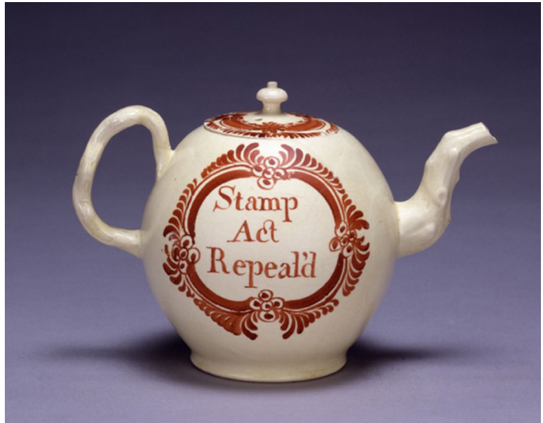
Men and women politicized the domestic sphere by buying and displaying items that conspicuously revealed their position for or against parliamentary actions. This witty teapot, which celebrates the end of taxation on goods like tea itself, makes clear the owner's perspective on the egregious taxation. Teapot, Stamp Act Repeal'd, 1786, in Peabody Essex Museum. Salem State University.

Resistance to the Stamp Act took three forms, distinguished largely by class: legislative resistance by elites, economic resistance by merchants, and popular protest by common colonists. Colonial elites responded by passing resolutions in their assemblies. The most famous of the anti-Stamp Act resolutions were the Virginia Resolves, passed by the House of Burgesses on May 30, 1765, which declared that the colonists were entitled to “all the liberties, privileges, franchises, and immunities . . . possessed by the people of Great Britain.” When the Virginia Resolves were printed throughout the colonies, however, they often included a few extra, far more radical resolutions not passed by the Virginia House of Burgesses, the last of which asserted that only “the general assembly of this colony have any right or power to impose or lay any taxation” and that anyone who argued differently “shall be deemed an enemy to this his majesty’s colony.” 8 These additional items spread throughout the colonies and helped radicalize subsequent responses in other colonial assemblies. These responses eventually led to the calling of the Stamp Act Congress in New York City in October 1765. Nine colonies sent delegates, who included Benjamin Franklin, John Dickinson, Thomas Hutchinson, Philip Livingston, and James Otis. 9