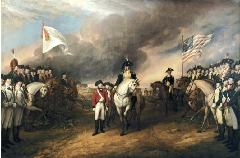
Lord Cornwallis's surrender signaled the victory of the American revolutionaries over what they considered to be the despotic rule of Britain. This moment would live on in American memory as a pivotal one in the nation's origin story, prompting the United States government to commission artist John Trumbull to create this painting of the event in 1817. John Trumbull, Surrender of Lord Cornwallis, 1820.